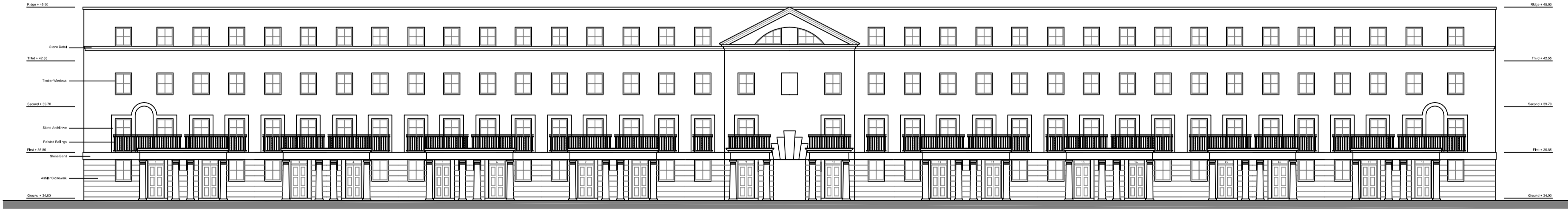
Front Elevation, Clouston Street 1:200