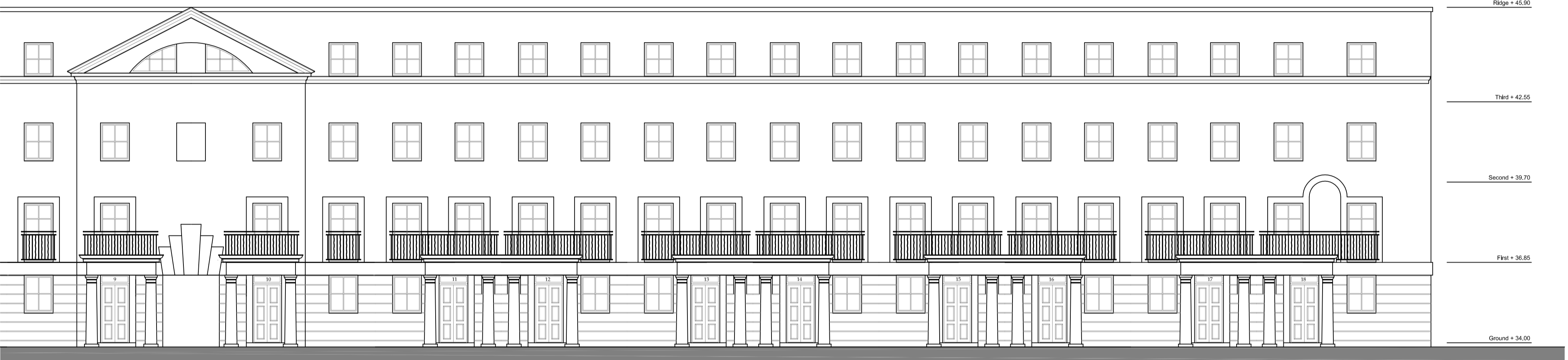
Front Elevation, Clouston Street 1:100