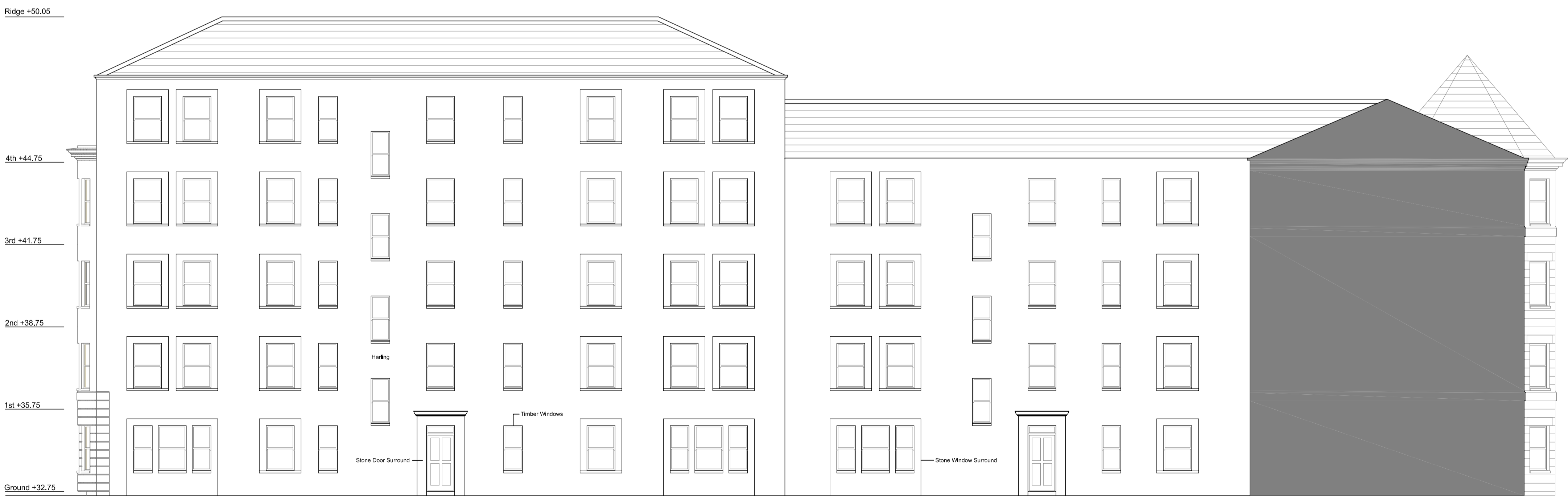
Rear Elevation, Kelbourne Street