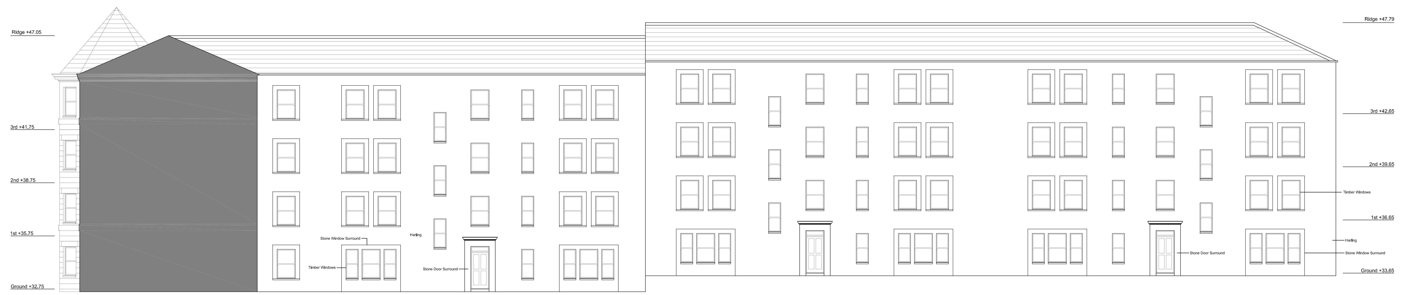
Rear Elevation, Sanda Street