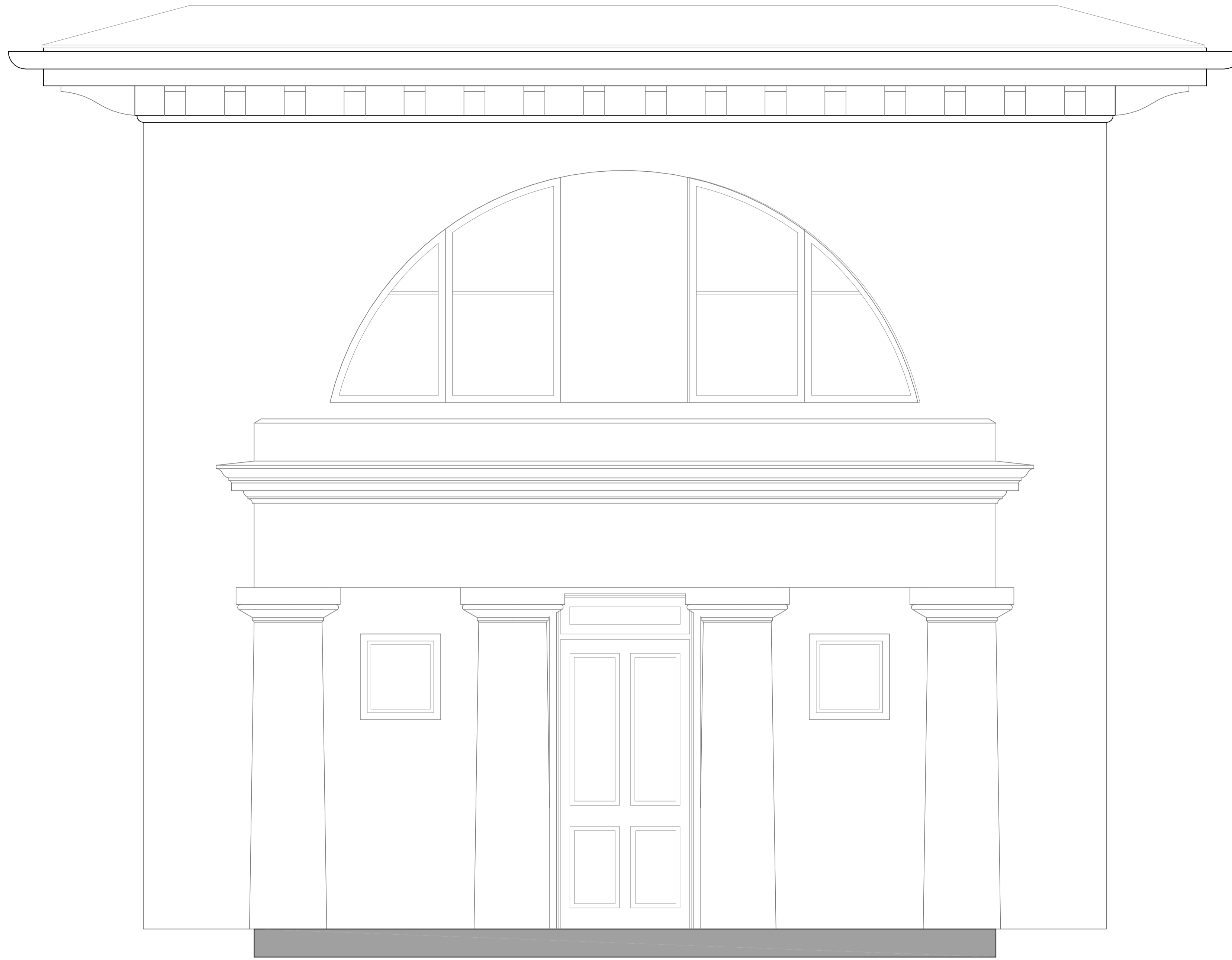
Door Casing - Elevation