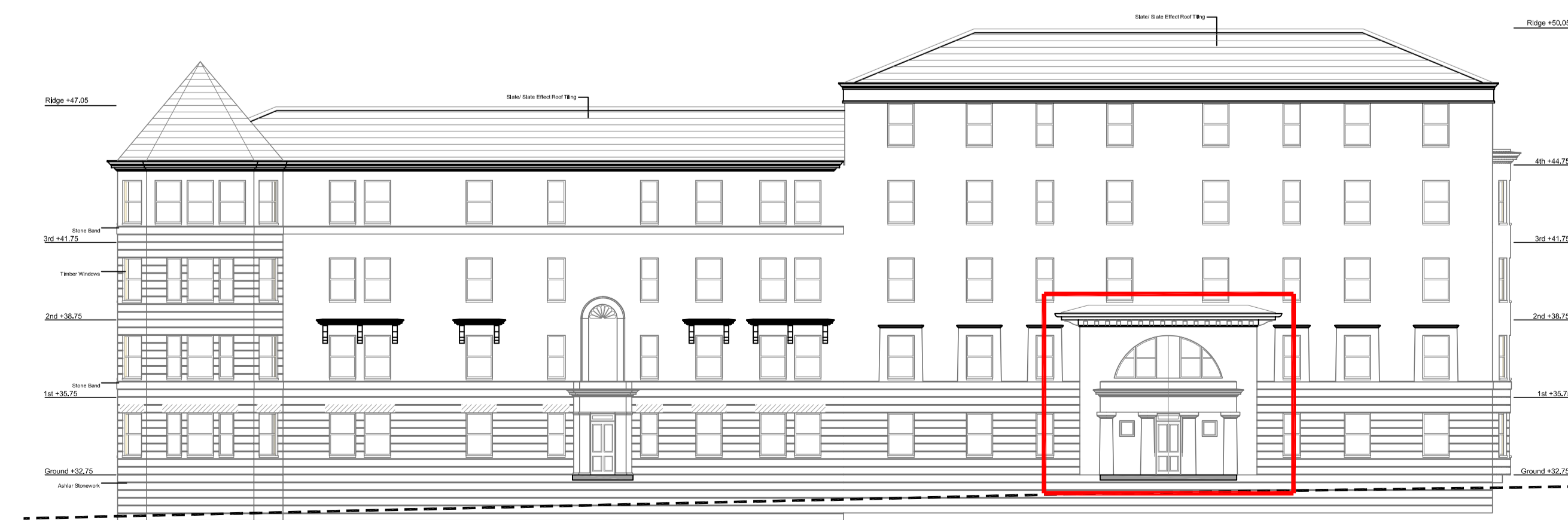
Front Elevation, Kelbourne Street